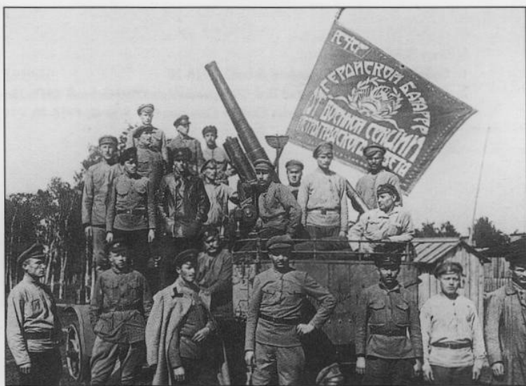
Mobile gun of an anti-aircraft battery in the Petrograd Fortified District, 1919. Many combinations of Red Army uniform are visible. The red banner is one presented by the Petrograd Soviet, the first administrative body to start awarding hand-embroidered red banners for 'glorious conduct in battle'. The gun is a Russian M.1914 Lender 76-mm anti-aircraft cannon.

Cossack units were rightly considered the