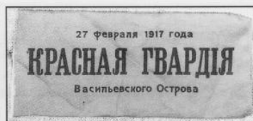
Armband of a Red Guard detachment formed by a local district Soviet in Petrograd (St Petersburg). It is made of red cotton with letters printed in black and reads: '27 February 1917 / Red Guard / of Vissilievsky Island'.

In December 1919 the Red Army numbered three million men; by 1 November 1920 this had increased to five and a half million. These men remained in arms until 1924 when the Red Army was demobilised and its numbers fell to 562,000.