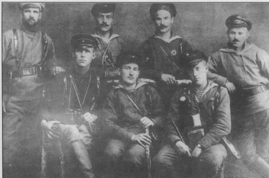
Naval infantry commanders of the Southern front dressed in a mixture of infantry and naval uniforms, with navy caps, dark-blue duck jumpers and undershirts all in evidence. Although infantry gear was obviously more practical on land, naval infantry – unquestionably some of the best troops of the Red Army – clung to their naval clothing with justified pride.