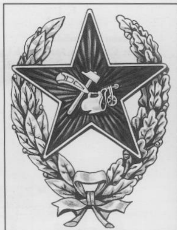
Official Red Army breast badge of 1918. It has the hammer-and-plough device, which gave way officially in 1922 to the better known hammer-and-sickle.

Red Army men serving in motorised, armoured-car and armour units all wore much the same uniform, characterised by the rich use of leather. It consisted of: a khaki cloth or leather cap with a large square peak, introduced in the Russian Army for automobilists and motorcyclists; a leather coat and gymnasterka. Leather or cloth breeches were worn with jackboots or boots with leggings. The dif-